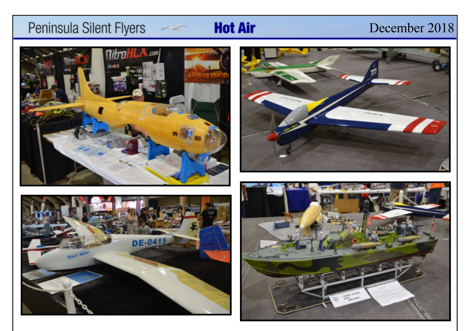
See all the Expo photos on our website!