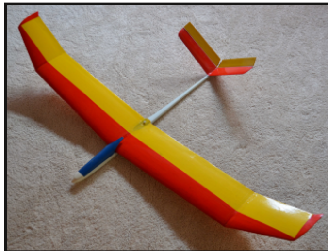
The V-Tail 60-Inch HLG