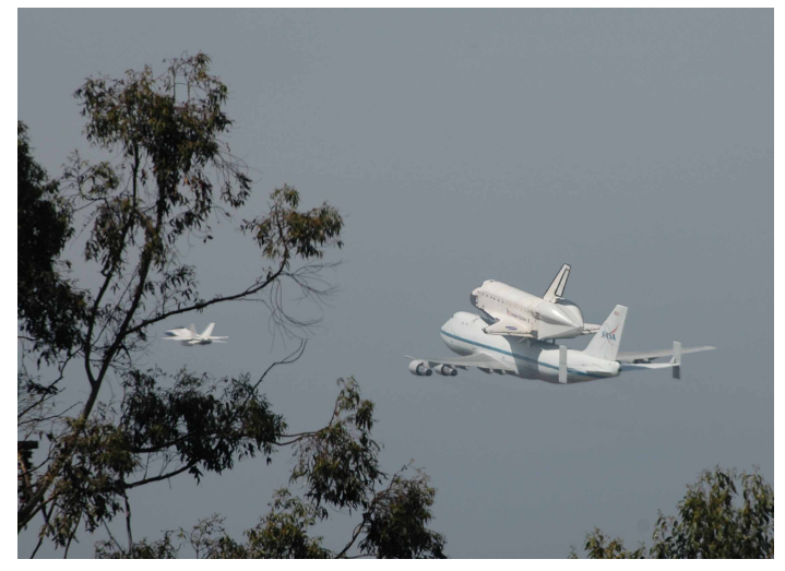
Jeff took these photos during the arrival of the shuttle Endeavor to LAX